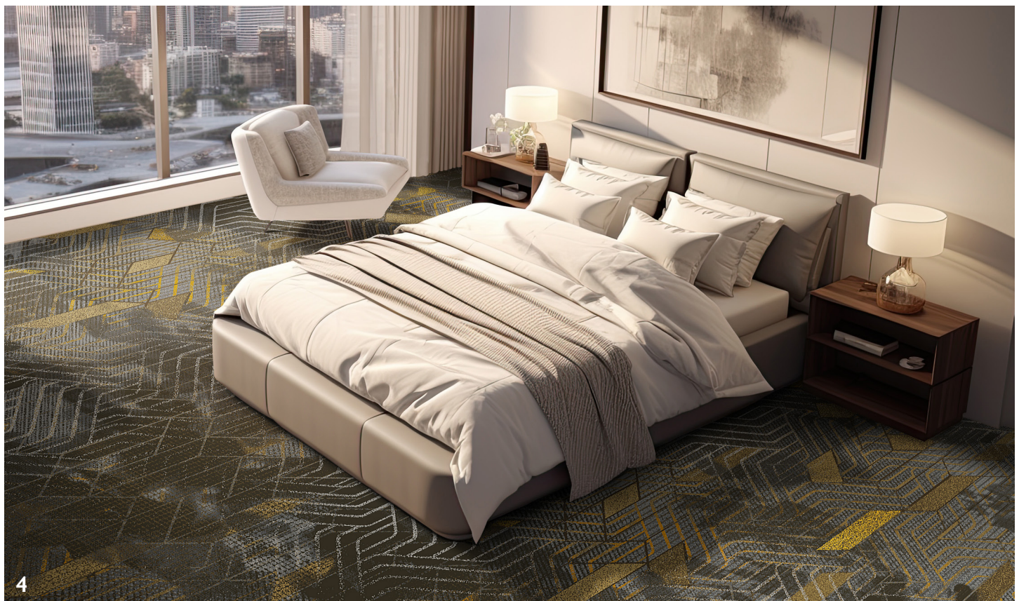
Pictured 3: Design Q01/A070323WG | Pictured 4: Design Q01/A070318WG